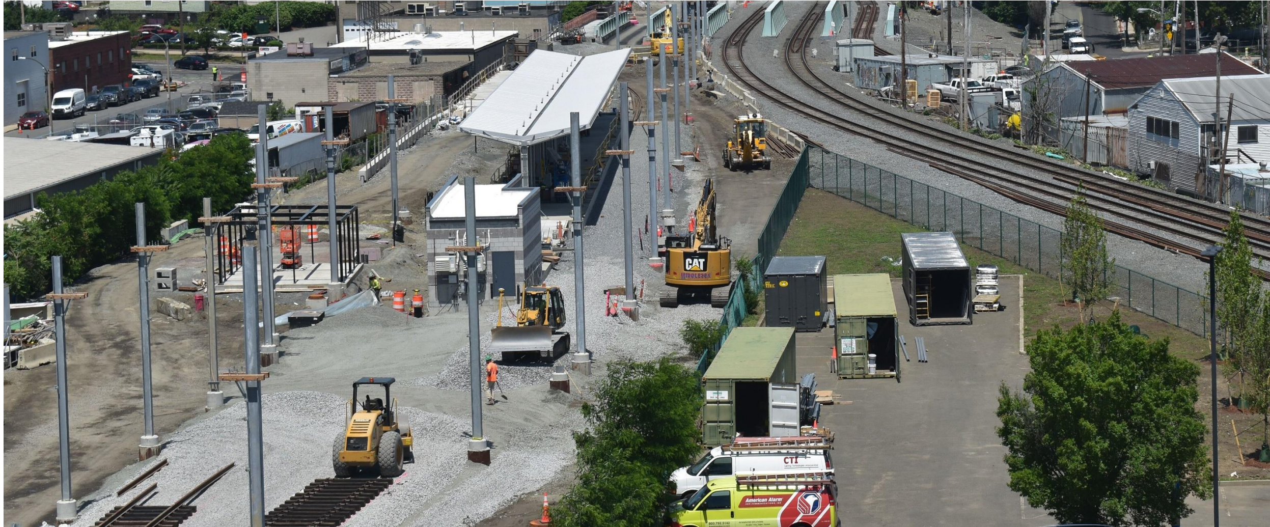
Future Site of East Somerville Station – June 2021

Draft for Discussion & Policy Purposes Only