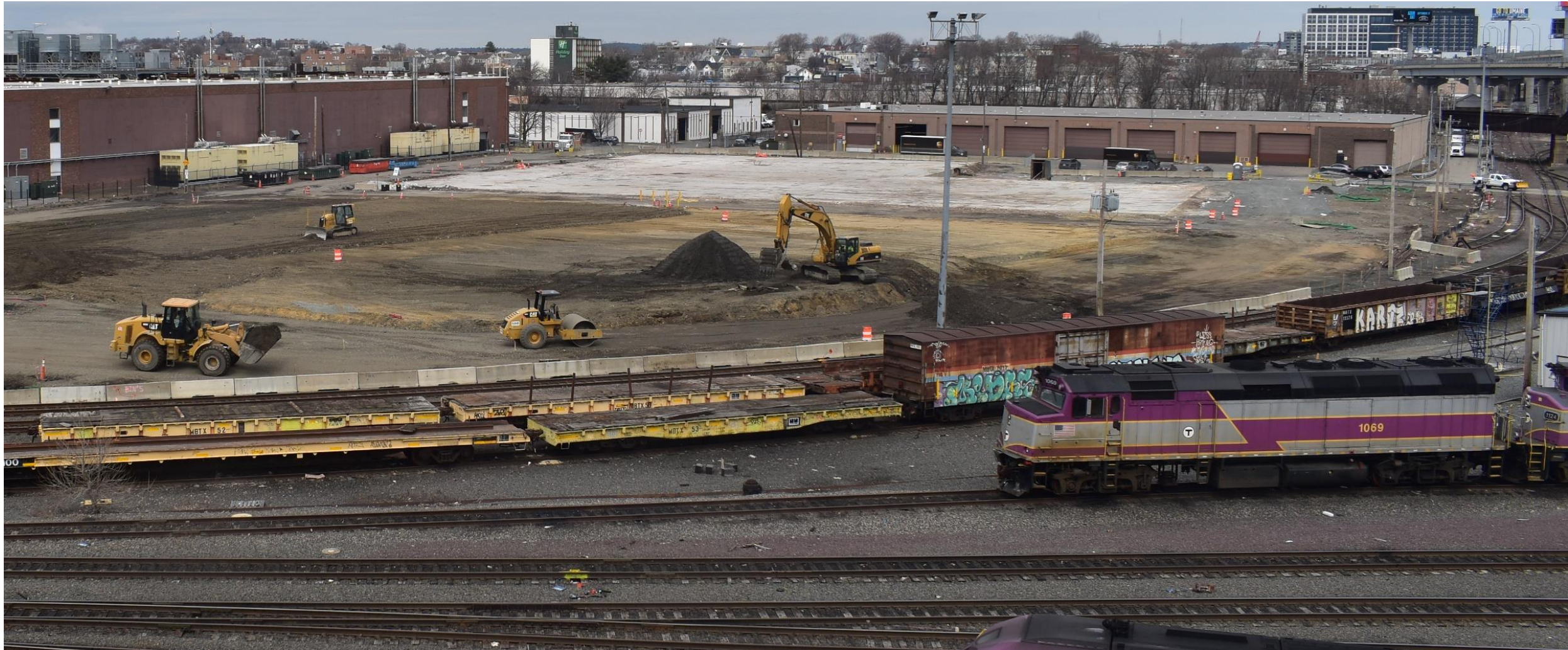
Future Site of GLX Vehicle Maintenance Facility – March 2019

Draft for Discussion & Policy Purposes Only