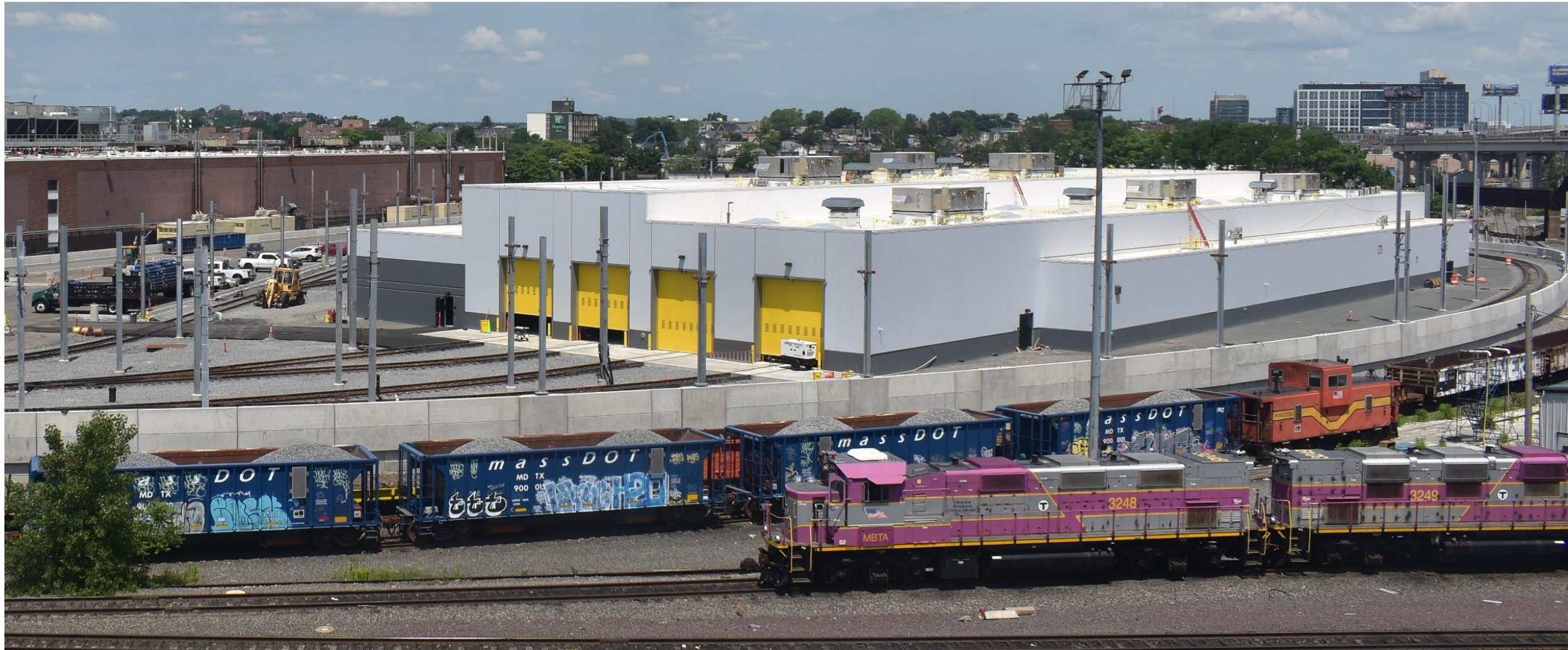
Future Site of GLX Vehicle Maintenance Facility – June 2021

Draft for Discussion & Policy Purposes Only