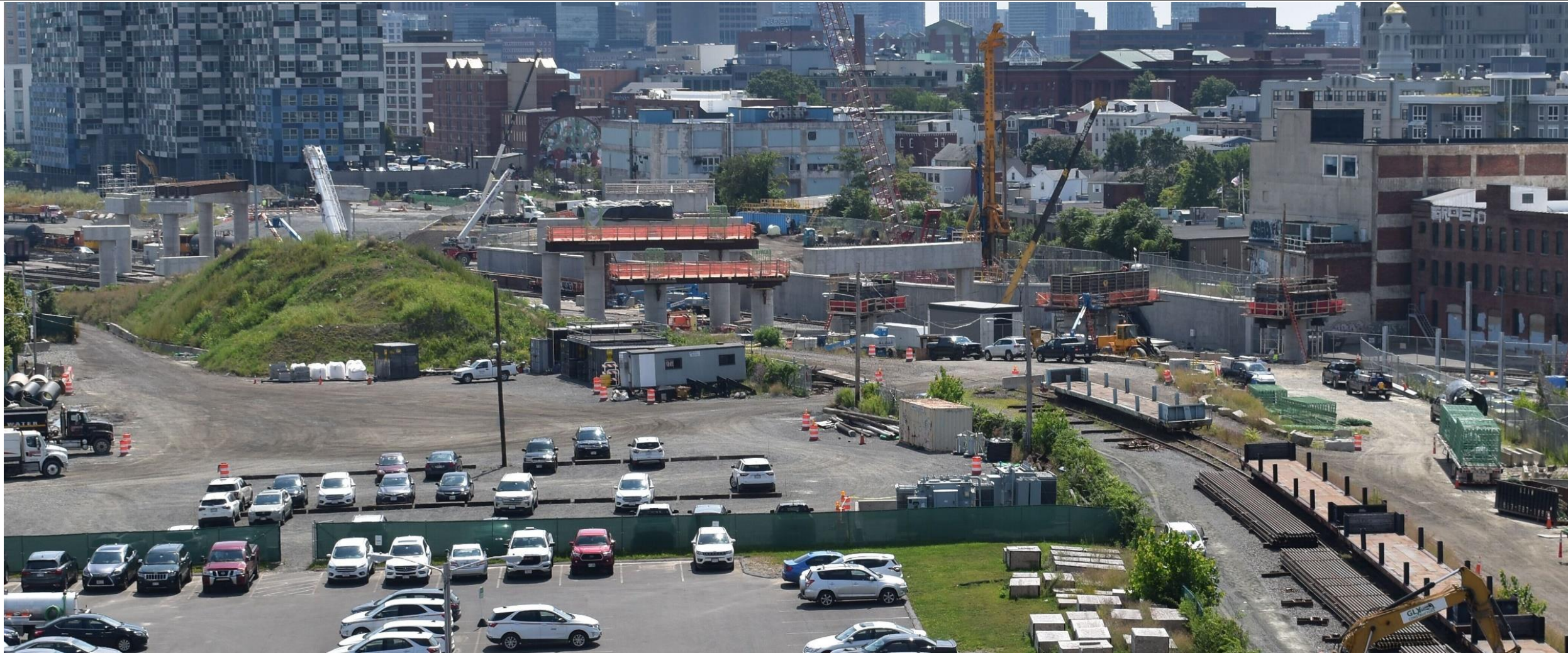
Future Site Red Bridge Viaduct – August 2019

Draft for Discussion & Policy Purposes Only