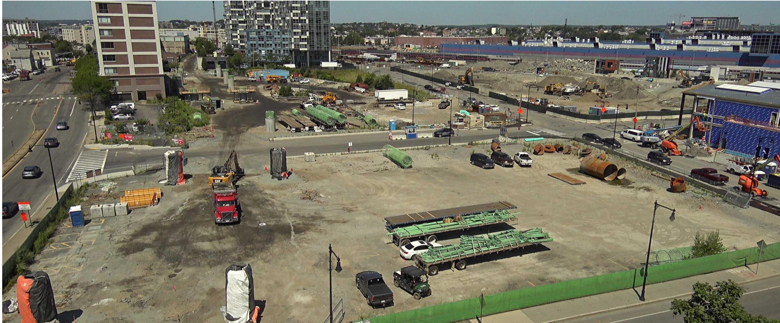
Future Site of Lechmere elevated Station – August 2019

Draft for Discussion & Policy Purposes Only