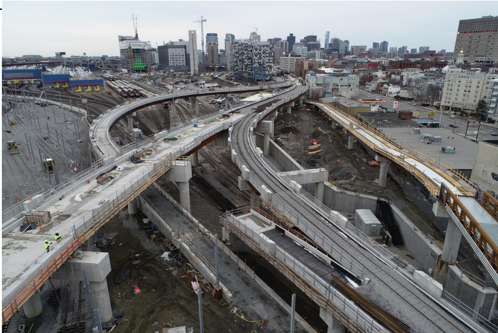
Aerial View – Red Bridge Viaduct – April 2021

Draft for Discussion & Policy Purposes Only