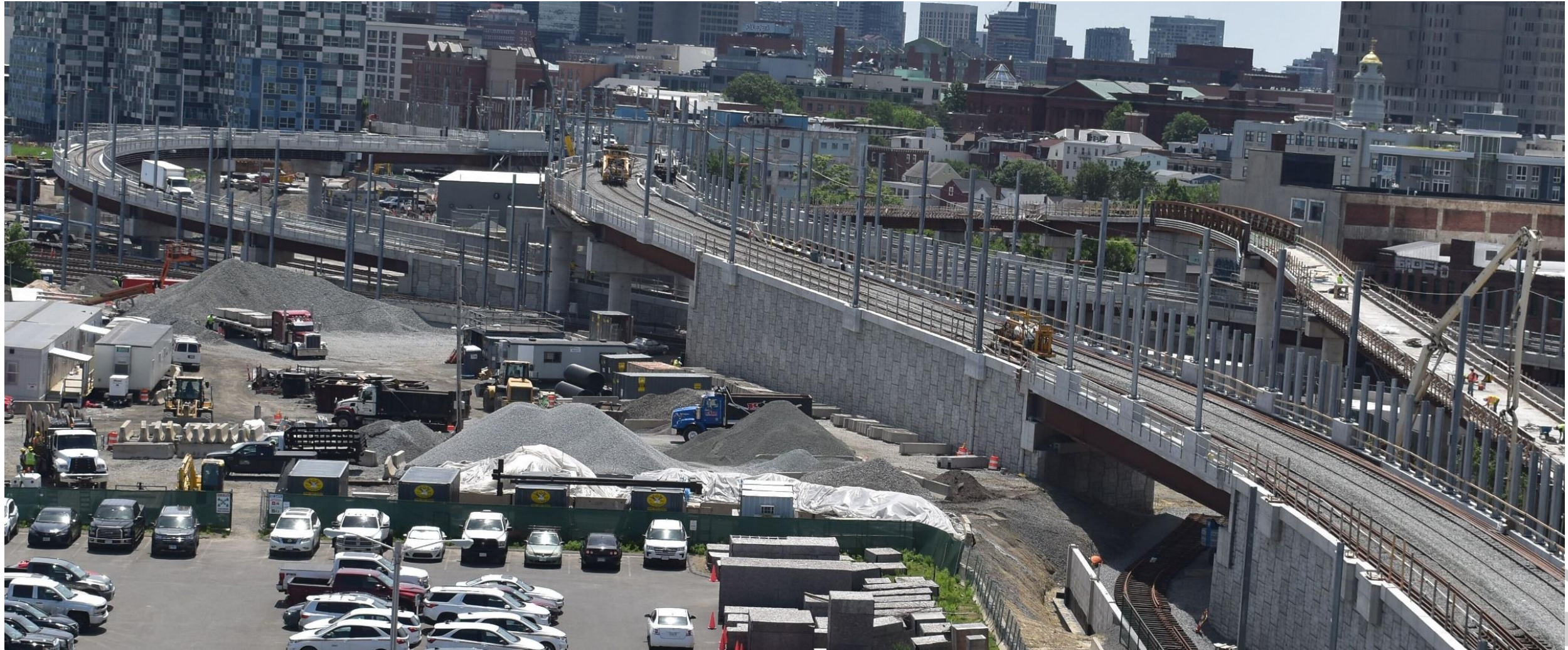
Future Site Red Bridge Viaduct – June 2021

Draft for Discussion & Policy Purposes Only