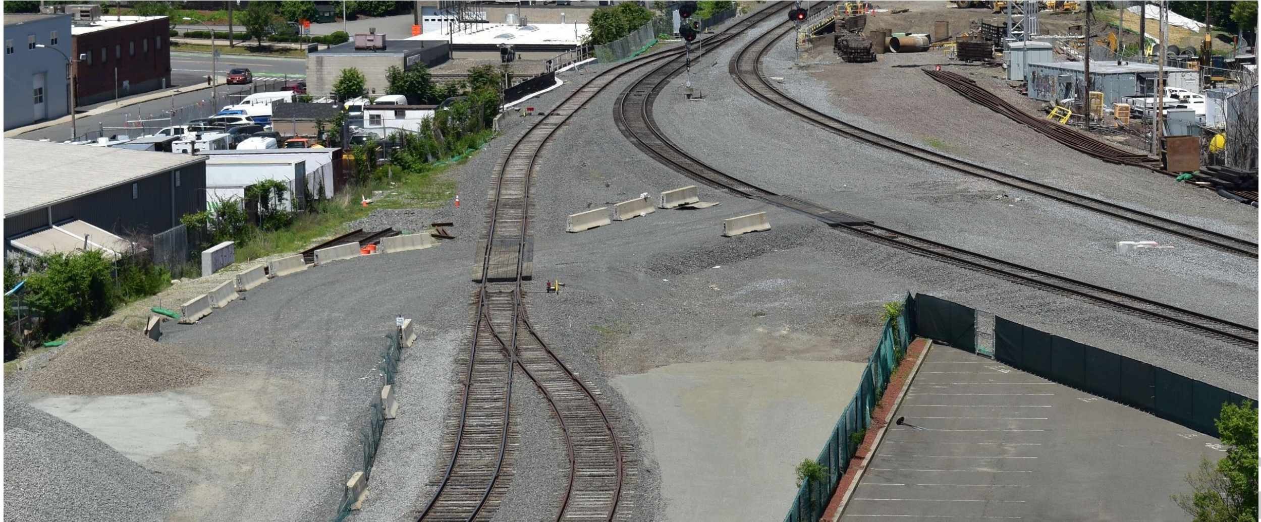
Future Site of East Somerville Station – June 2019

Draft for Discussion & Policy Purposes Only