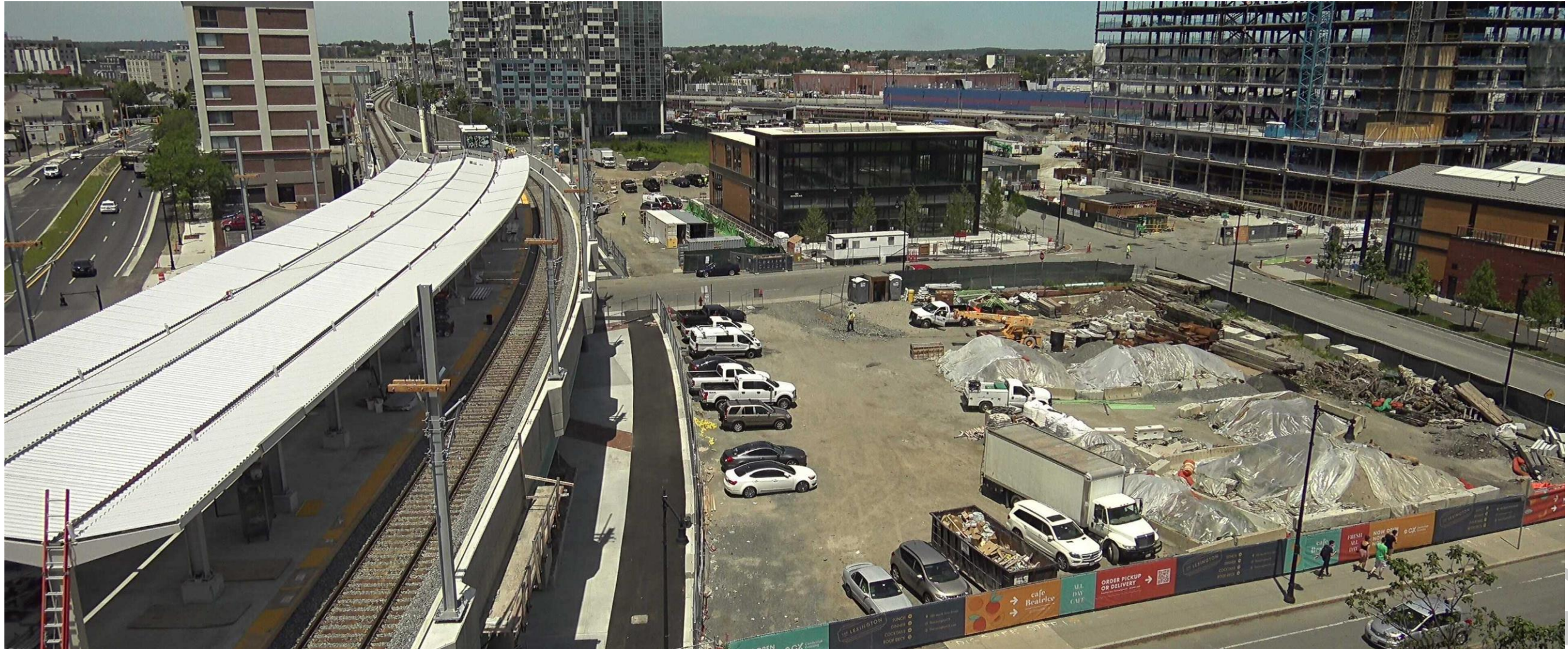
Future Site of Lechmere elevated Station – June 2021

Draft for Discussion & Policy Purposes Only