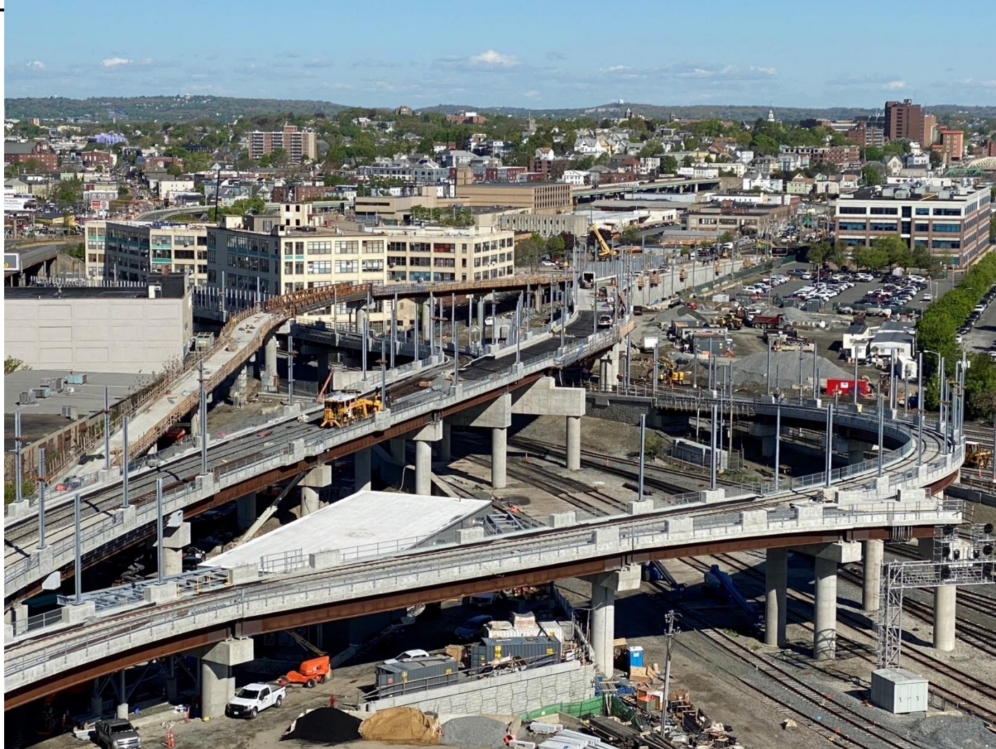
Aerial View – Red Bridge Viaduct – May 2021

Draft for Discussion & Policy Purposes Only