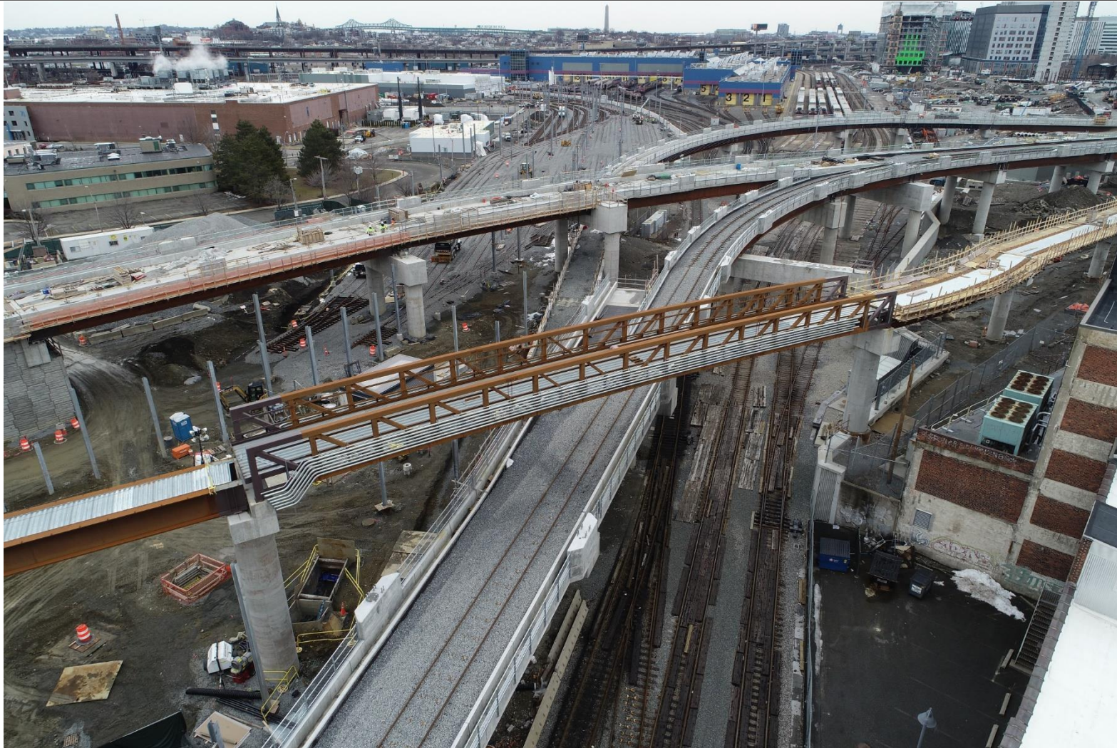
Aerial View – Red Bridge Viaduct – April 2021

Draft for Discussion & Policy Purposes Only