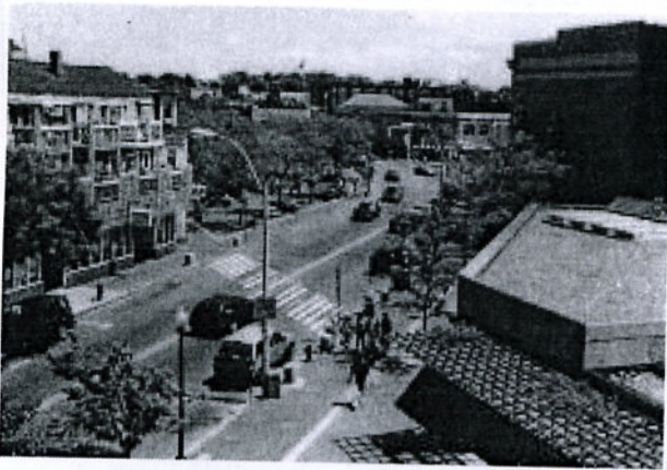
Figure 3-20. In Davis Square, ample paved pedestrian crosswalks and refuges are provided to make navigating between the Red Line T (subway) station, bus stops, and this seven-point intersection easier.