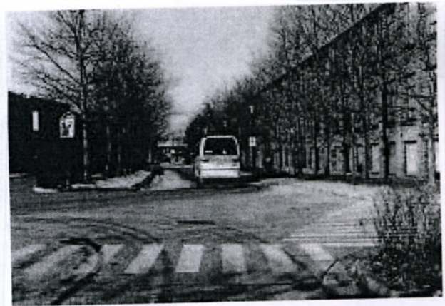
Figure 3-21. A dedicated bus way serves the College Avenue T station entrance.